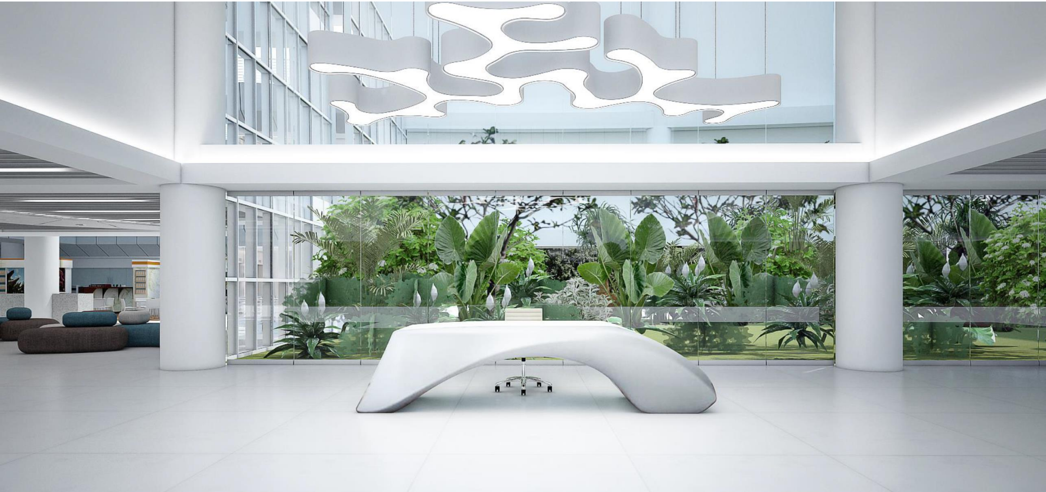
Modern Lobby & Reception