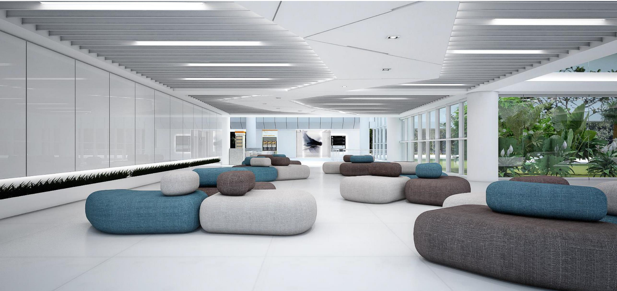
Comfortable Waiting Area