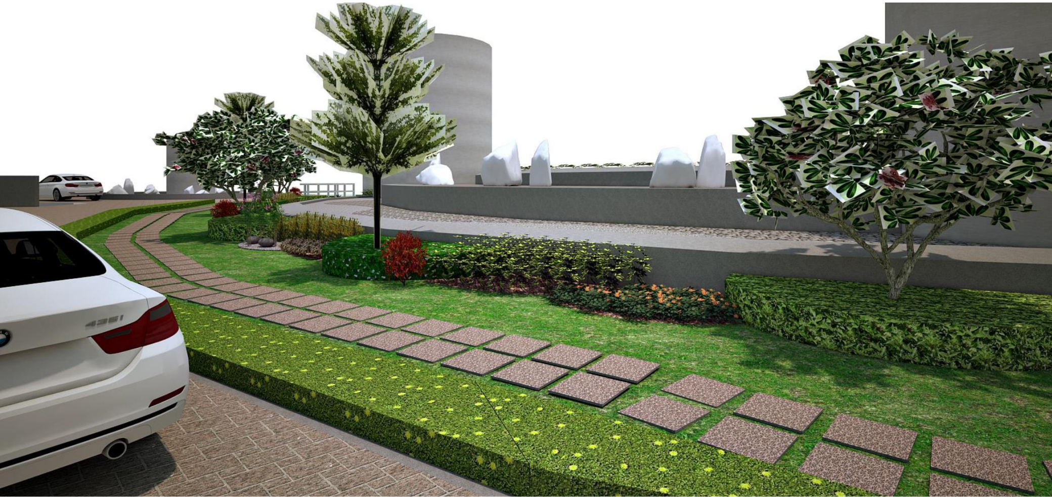
New External Landscape and Footpath